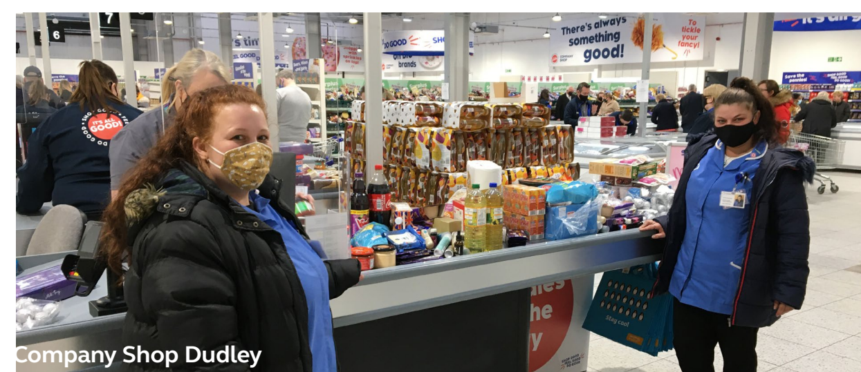
Company Shop Dudley

IF YOU ARE PART OF THE FMCG SUPPLY CHAIN MAKE SURE THAT YOUR EMPLOYEES ARE NOT MISSING OUT.