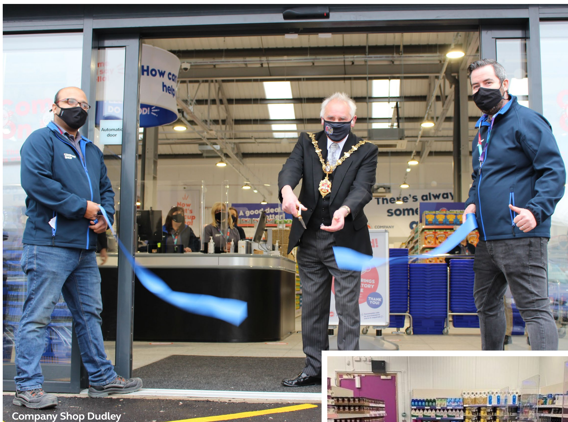
Company Shop Dudley

Let our expert team help you; drop us an email to surplus@companyshopgroup.co.uk or give us a call on 0800 211 8484.